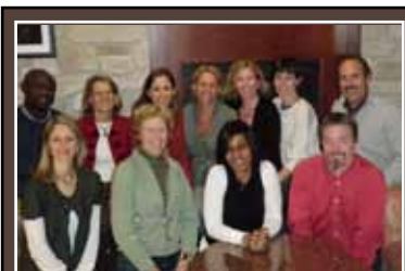
Nurturing Minds Board 2010