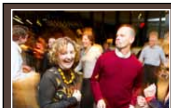
The afro-pop music was a hit at the African Dance Party fundraiser held in Brighton, MA in Jan.

Bryn Mawr Presbyterian Church donated $5,000 towards Segas's Non-Formal Education Day Program and HIV Training.